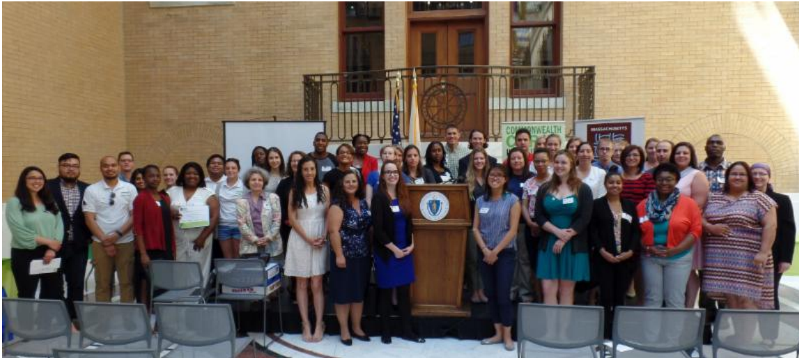
2015-2016 Commonwealth Corps members and host site staff

Commonwealth Corps members and host site staff also shared their highlights. Thank you to our 30+ Commonwealth Corps members and 17 host site partners for contributing over 42,000 hours of service during the 2015-2016 program year!